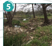
Upper Cypress Creek near the City of Woodcreek.