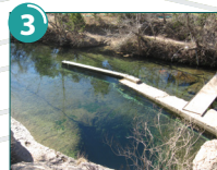
Jacob's Well in Cypress Creek, near the City of Woodcreek.