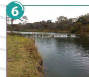
Low water dam along Cypress Creek.