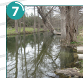
Cypress Creek at Blue Hole Park in the City of Wimberley.