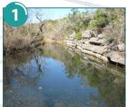
Cypress Creek, looking upstream from Jacob's Well.