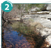
Upper Cypress Creek, upstream from the City of Woodcreek.