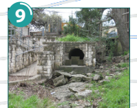
Stormwater outfall serving downtown Wimberley.