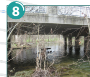
Ranch Road 12 Bridge in downtown Wimberley.