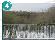
Cypress Falls in the City of Woodcreek. The water supply tower can be seen in the background.