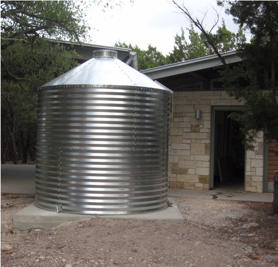
Blue Hole Regional Park