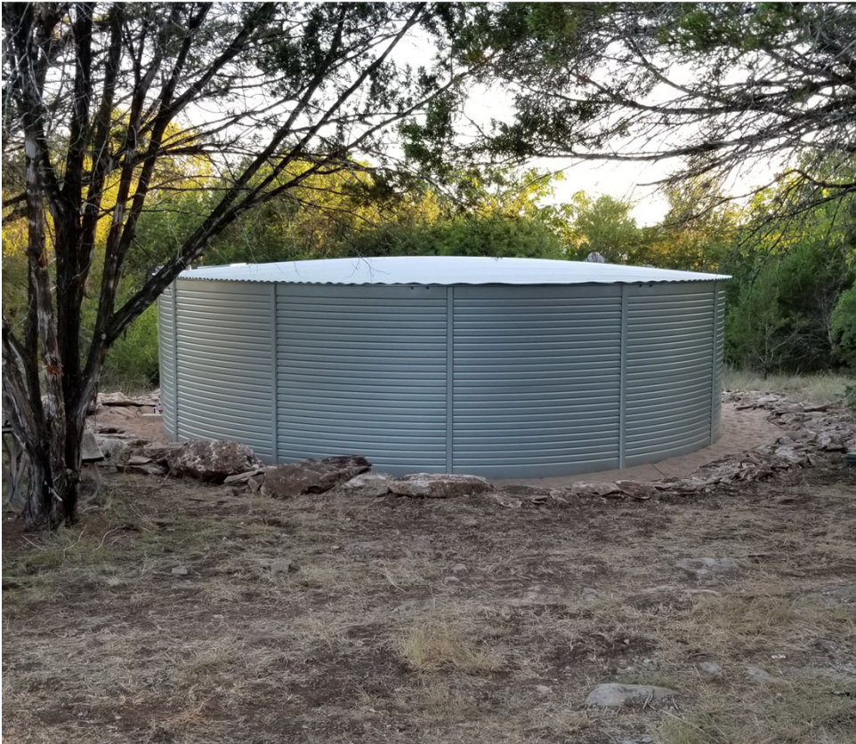
Wimberley Valley Watershed Assoc.