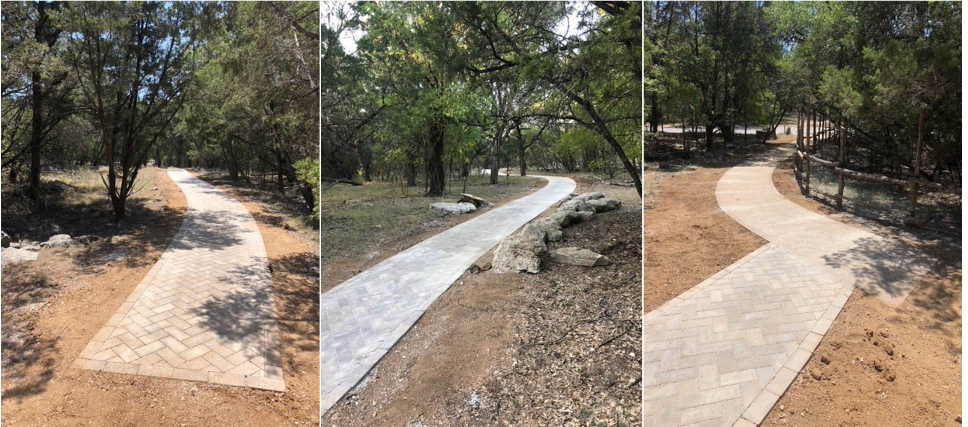
Blue Hole Regional Park