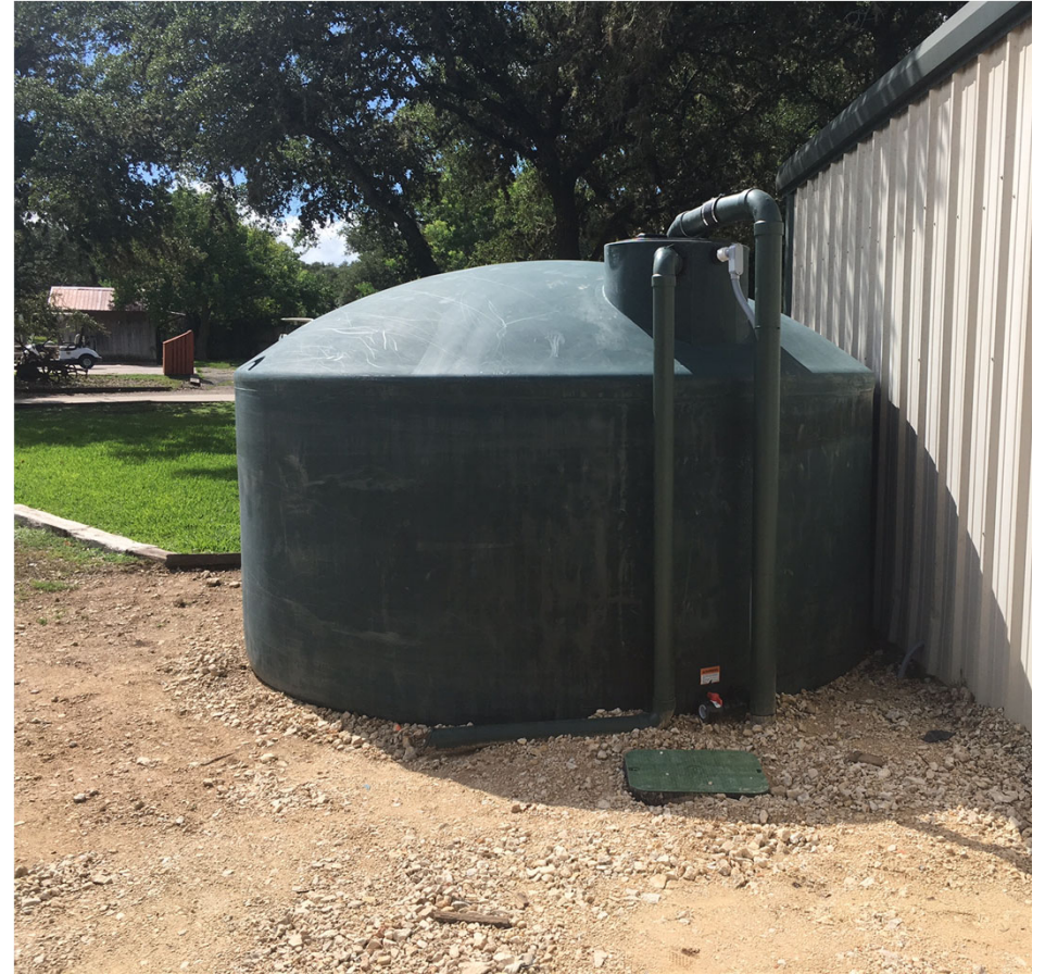
Woodcreek Golf Course