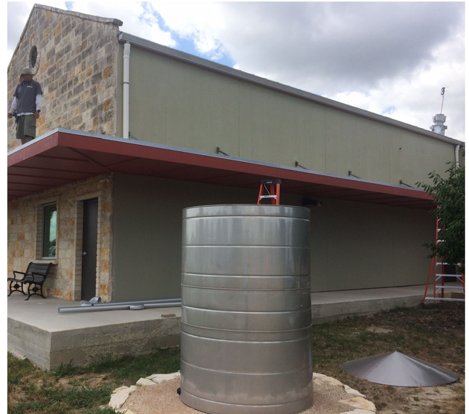
Hays Precinct 3 Office